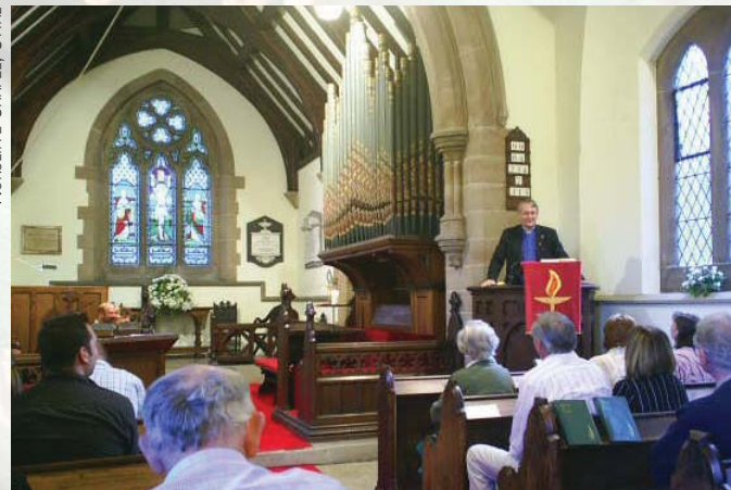
NORCLIFFE CHAPEL, STYAL

Readings are often taken from the Jewish and Christian scriptures , with an additional passage from a non-biblical source. However, some Unitarian groups rarely choose to read from the Bible. All writings that reflect upon the human condition, our relationships with God and with the natural world, are deemed worthy of study and reflection. Unitarians acknowledge their roots in the Judaeo-Christian tradition, but feel that religious truth is not limited to a specific collection of writings. This breadth of interest is reflected in the content of the service, which is intended not to indoctrinate, but to encourage each person to think for herself or himself.