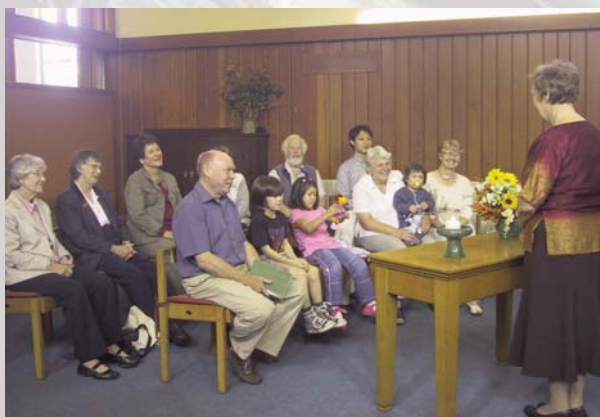
BRADFORD UNITARIAN CENTRE