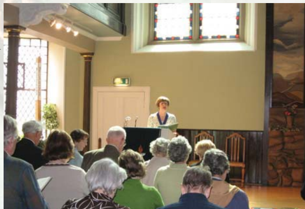
ST MARK'S UNITARIAN CHURCH, EDINBURGH

Unitarians enjoy listening to the opinions of others, so let someone know your impressions after the service! The minister or leader, or church members would be pleased to answer any questions you might have.